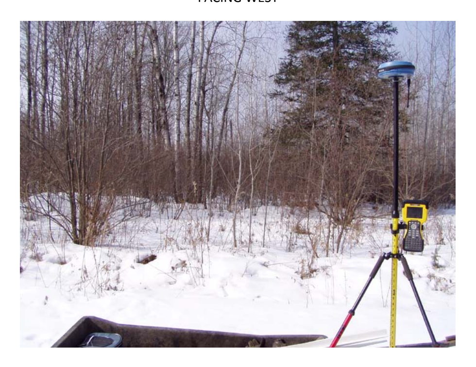
LINCOLN COUNTY MONUMENT SET