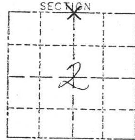
LOCATION (INDICATED BY X)

ELEVATION -(FEET): _____ DATUM: _____ THETA ANGLE: _____ WEATHER: SUNNY DATE OF SURVEY: FEB 1, 1972 TEMPERATURE: 10 °F SURVEY PARTY: ABENDROTH, DENZINE, MOSHER