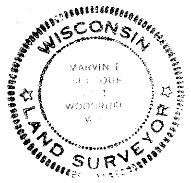
EXHIBIT "A" T 32 N, R 7 E, Lincoln Co. Sec. 22; Part of N 1/2 of NW 1/4