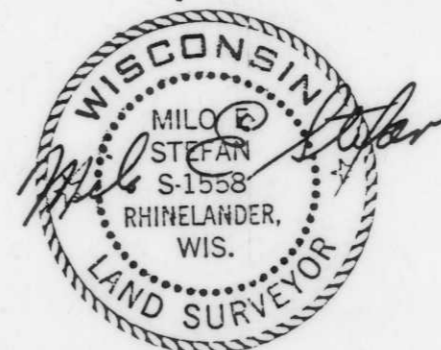
EXHIBIT NO. 3 RAYMOND B. KRAEMER DATE 3-28-94