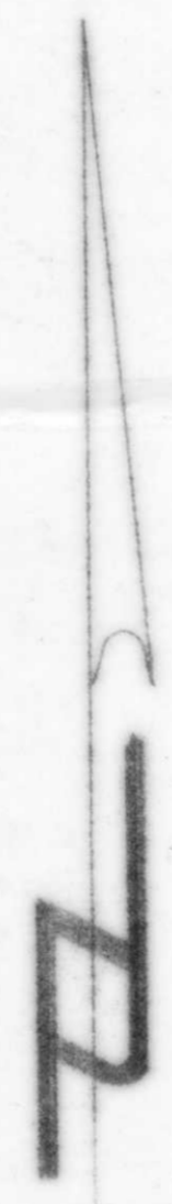
BEARINGS PER ORIGINAL PLAT