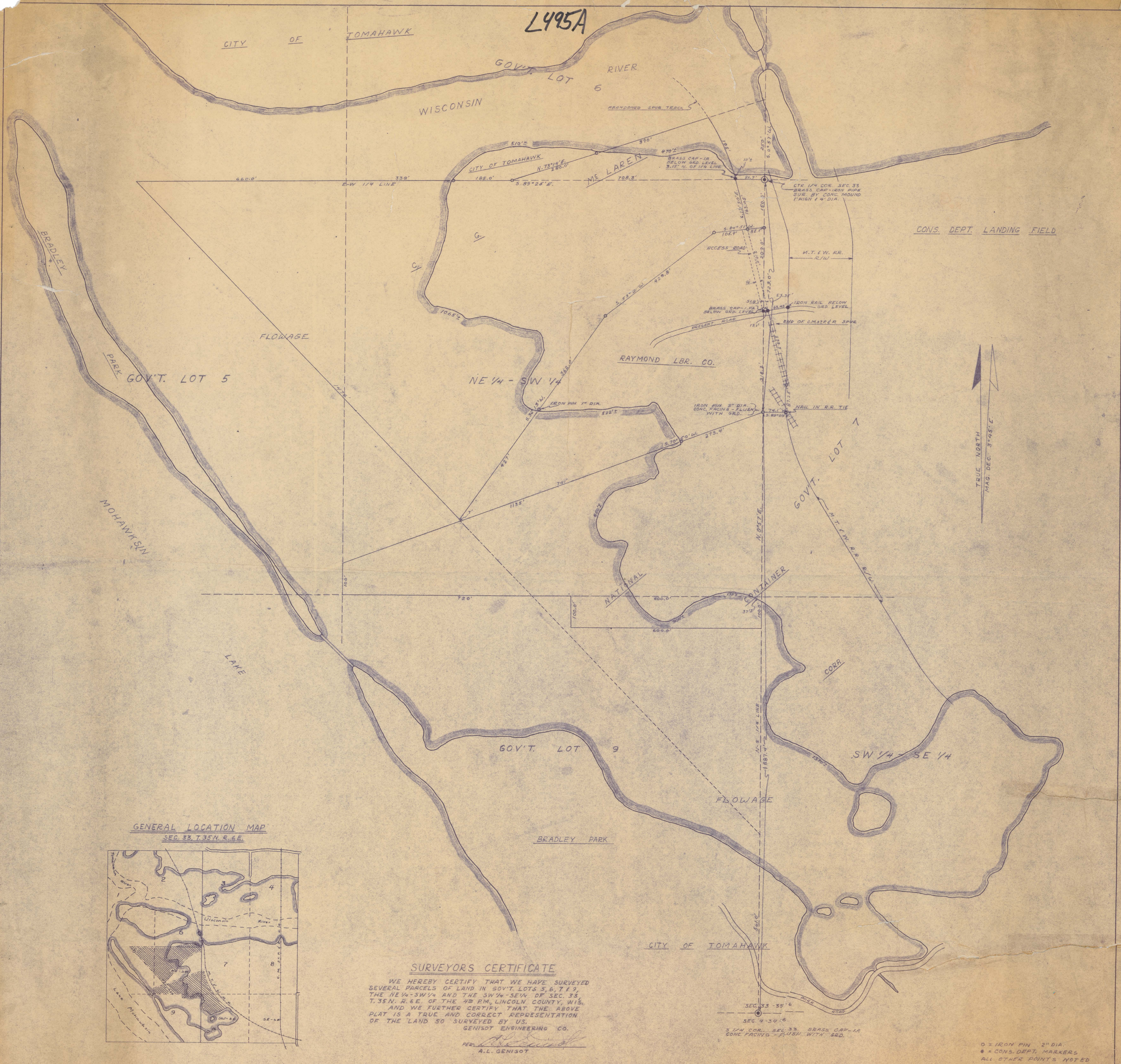
GENERAL LOCATION MAP SEC. 33, T. 35 N. R. 6 E.