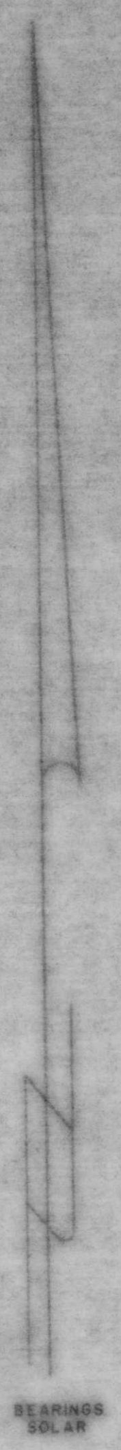
CURVE DATA TABLE