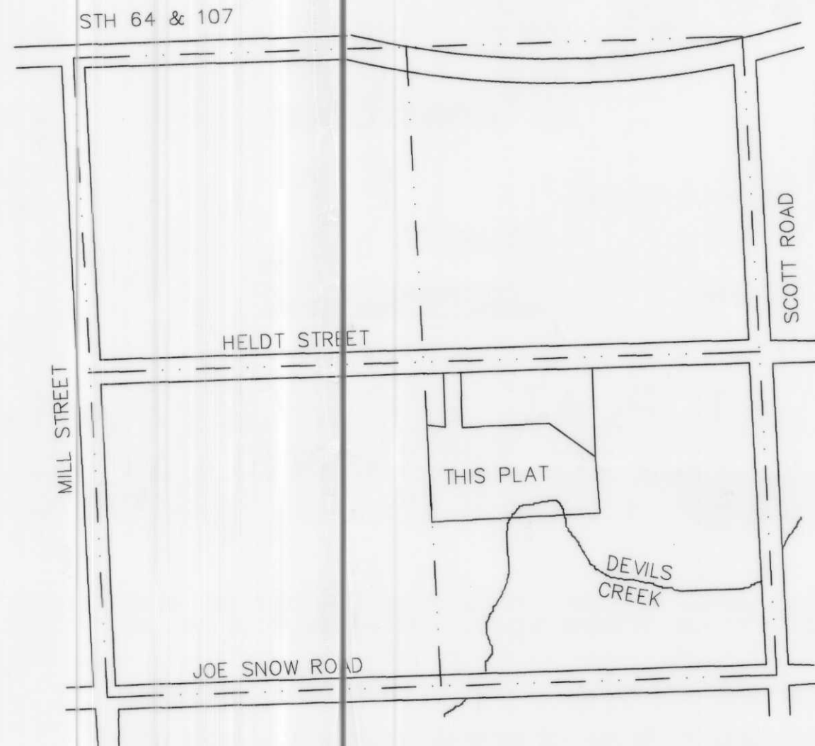
LOCATION SKETCH 16-31-6

LOCATED IN THE NORTHWEST 1/4 OF THE SOUTHEAST 1/4 OF SECTION 16, TOWNSHIP 31 NORTH, RANGE 6 EAST, TOWN OF SCOTT, LINCOLN COUNTY, WISCONSIN.