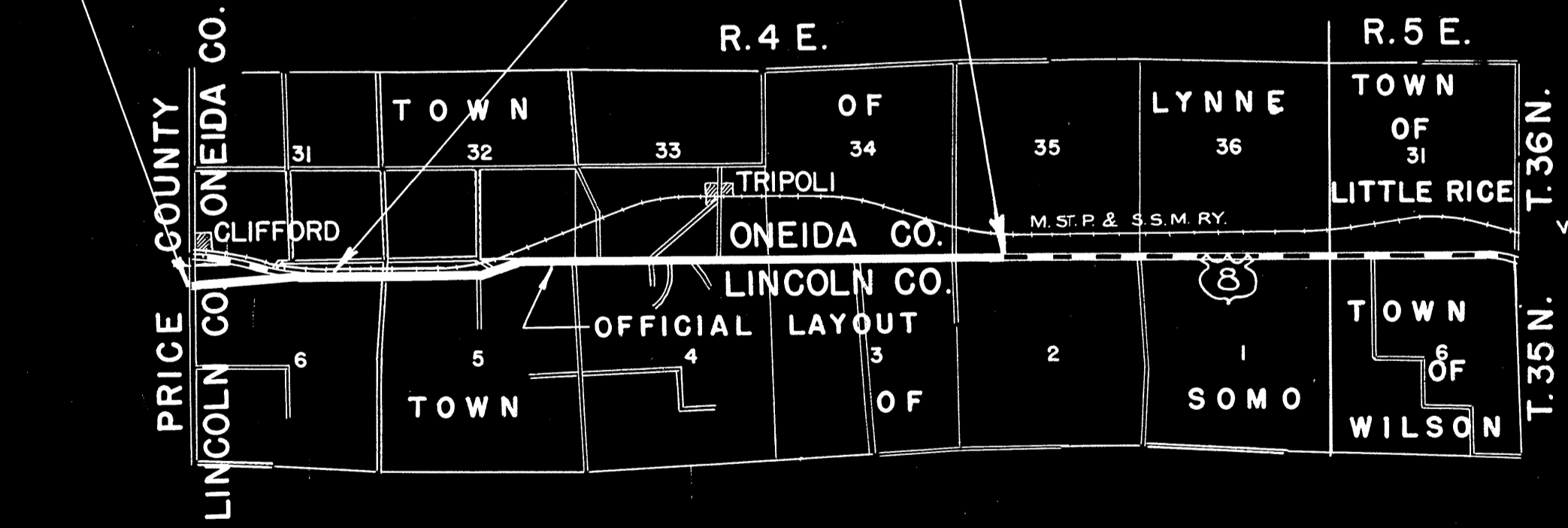
LOCATION SKETCH 0 1MI. 2MI. SCALE

STATION EQUATION 670+36.2 BACK = 672+70.5 AHEAD