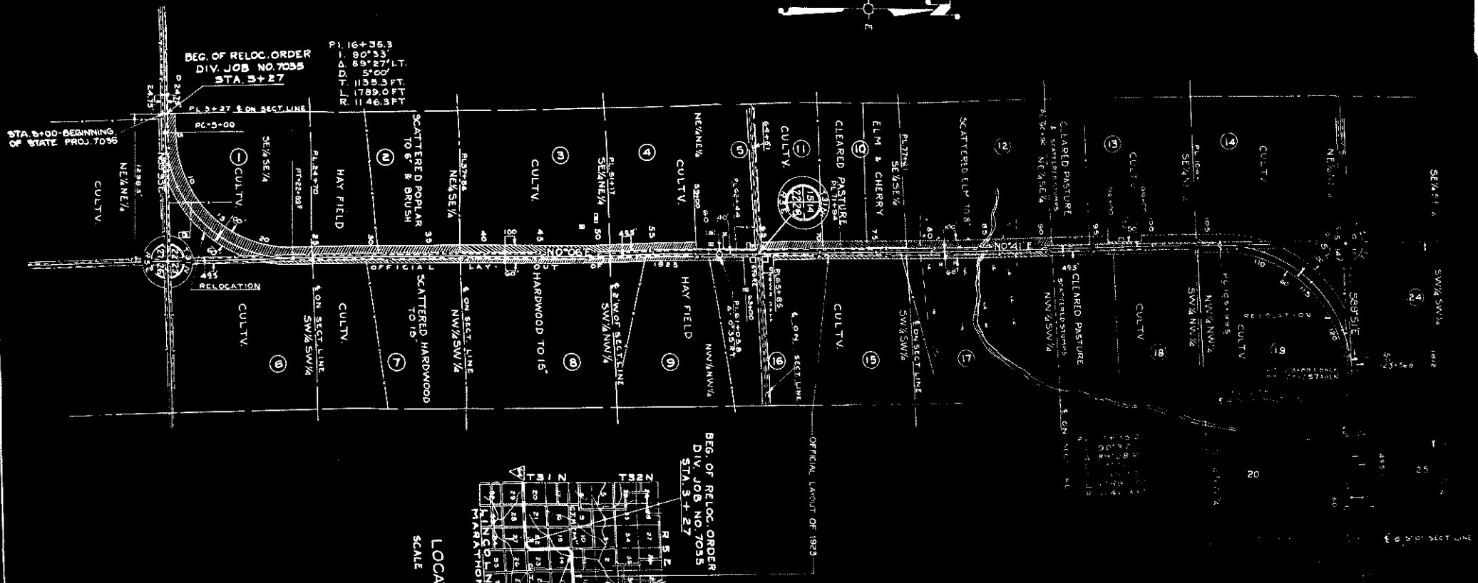
LOCATION SKETCH SCALE