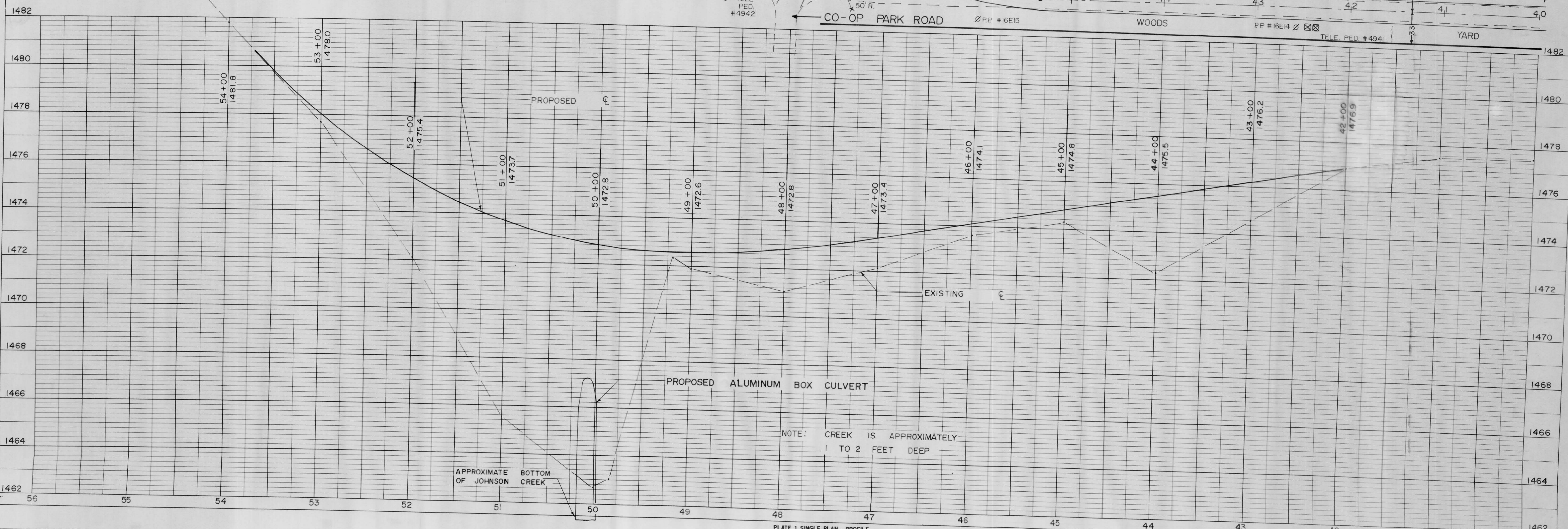
PLATE 1 SINGLE PLAN - PROFILE CHARLES BRUNING CO. MADE IN U.S.A.