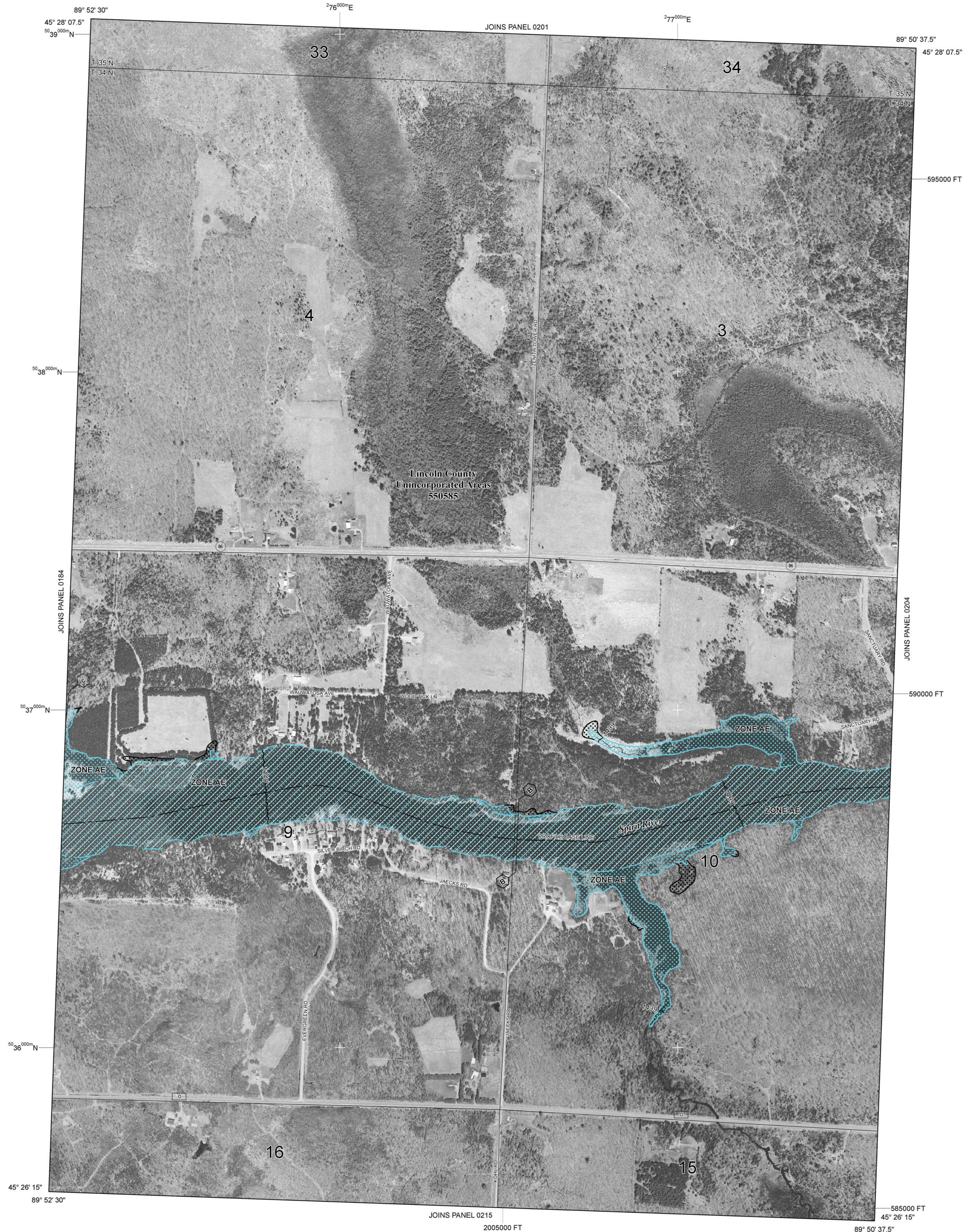
NOTE: MAP AREA SHOWN ON THIS PANEL IS LOCATED WITHIN TOWNSHIP 34 NORTH, RANGE 5 EAST AND TOWNSHIP 35 NORTH, RANGE 5 EAST.

If you have questions about this map or questions concerning the National Flood Insurance Program in general, please call 1-877-FEMA-MAP (1-877-336-2627) or visit the FEMA website at http://www.fema.gov .